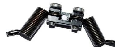
Spring Assembly Set with Hook