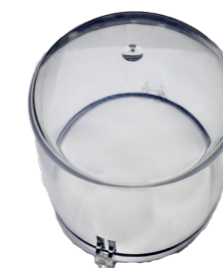
Dome for FastPrep 24 Classic