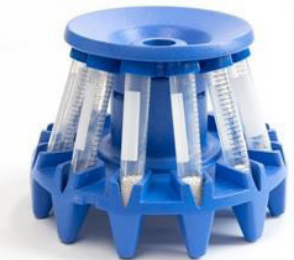
TeenPrep Tube Holder