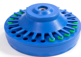
CoolPrep Tube Holder