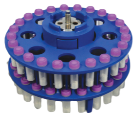
HiPrep Tube Holder