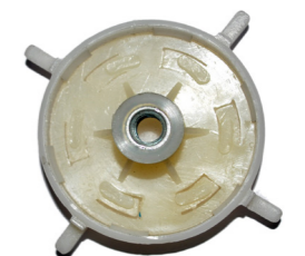
Ratchet Nut for FastPrep 24 Classic